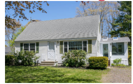
Multiple Offers $275,000