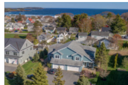
Higgins Beach $760,000 - 6/29/20