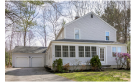
$28K Over List $453,000 - 3/20/20