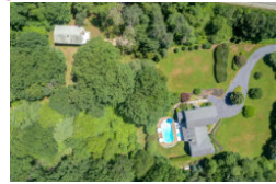
Stoneridge / Spurwink Estate $1,750,000