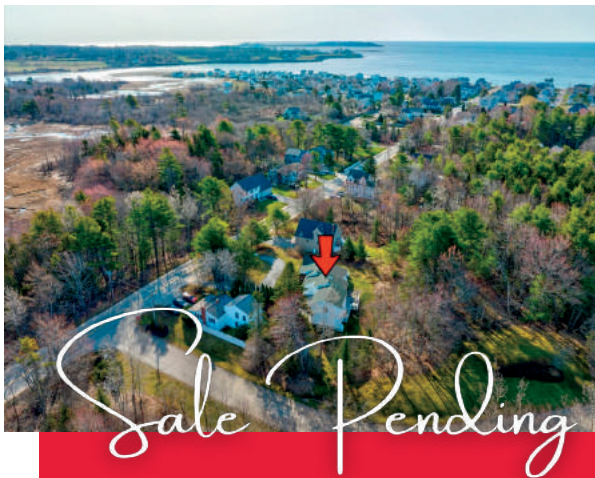
66 Ocean Avenue

The past two years have seen a record low number of transactions in our community. Overall for the State of Maine, the number of sales has dropped nearly 25% from the first quarter of last year. The good news for sellers is that median sales price has increased by almost 10% during the same period. Our community is not immune to these shifting market conditions. As a potential seller, the historically low inventory coupled with high demand puts you at an advantage. Trust our local knowledge, experience, and expertise in the Higgins Beach community to help you make a move.