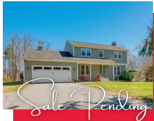
119 Spurwink Road

Proven results in EVERY market for over 20 years! Contact us to sell your home today. ☎ 207.553.1387