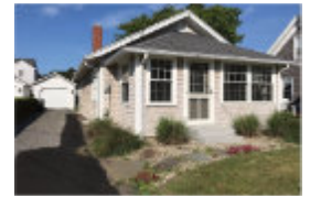
16 Ocean Avenue $652,000 • 7/14/17