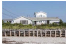
1 White Sands Lane $795,000