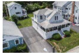
24 Ashton Street $833,500 • 9/8/17