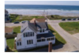
11 Ashton Street $795,000 • 7/21/17