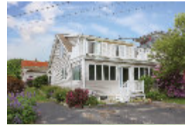
20 Ocean Avenue $740,000 • 9/8/17